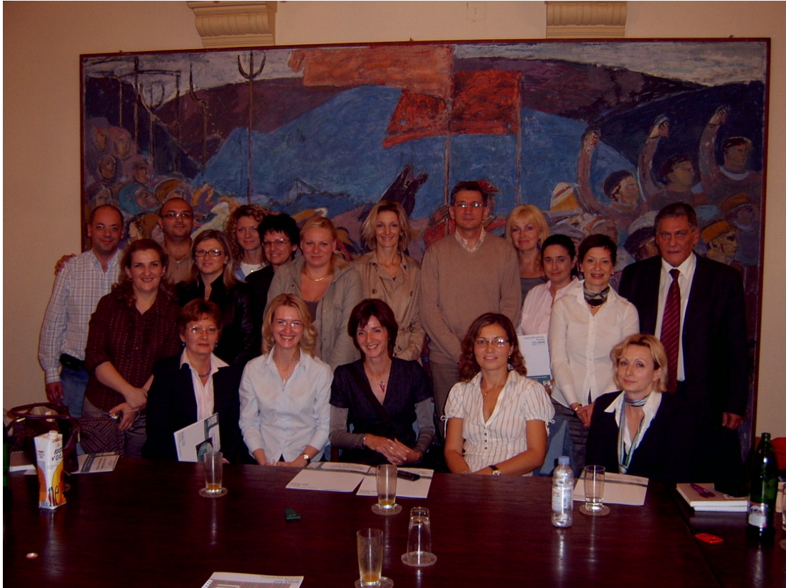
Serbian Asociation of Anesthesiologists and Intensivists (SAAI) www.insta.org.rs